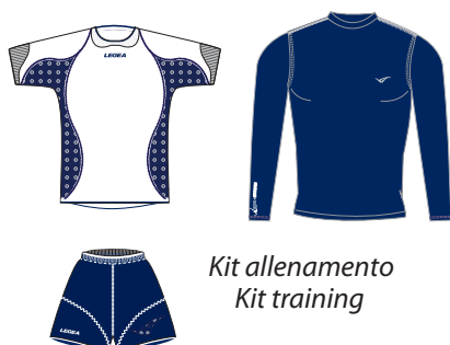
Kit allenamento Kit training