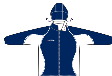
Giacca pioggia Rain jacket