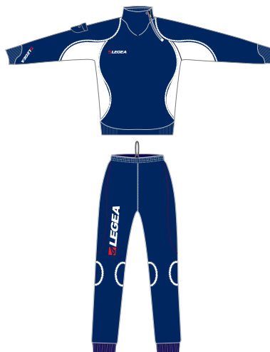
Tuta allenamento Training tracksuit